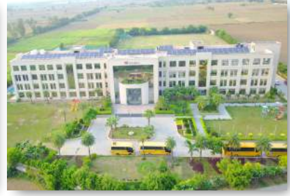
48 KW: Scholars Global School, Haryana, India