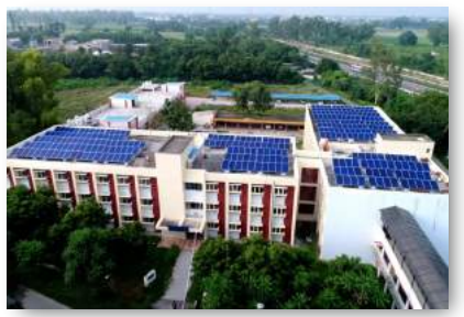
1 MW: National Dairy Research Institute (NDRI), Haryana, India