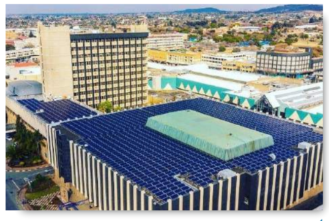
500 KW: Ekurhuleni Civic Centre, South Africa