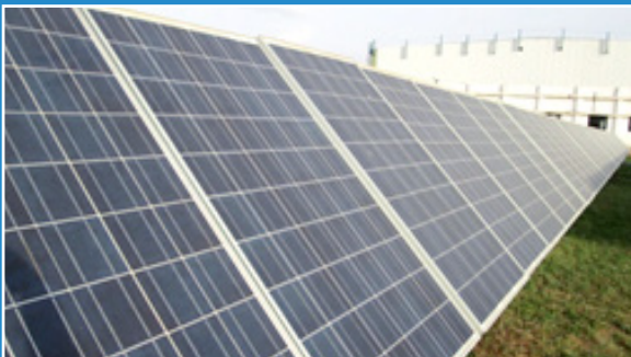
Hyderabad facility - Module Installations