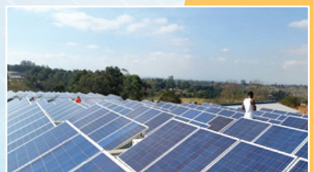
Successful installations by RenewSys in South Africa