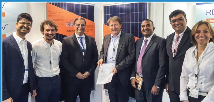
Our team with the visitors at RenewSys Stall- Intersolar Munich 2016

http://www.renewsysworld.com/media/userfiles/files/White%20Paper%20on%20the%20study%20of%20UV%20properties%20of%20EVA%20Encapsulant.pdf