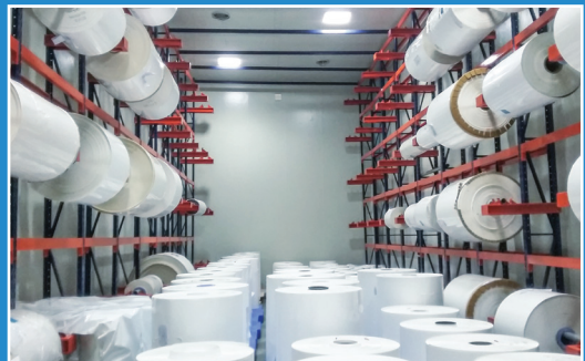
Bengaluru facility - Backsheet Storage