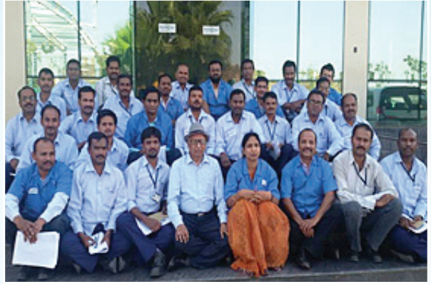
Training on 'Supervisory Skill Development' RIPL Hyderabad - 18th & 19th Apr '16