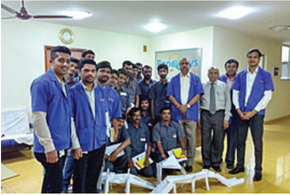
Training on 'Self-Motivation and Quality of Life' RIPL Bengaluru - 6th May '16

The growth of a business is significantly diminished if it does not incorporate the growth of its people & RenewSys ensures that its employees are exposed to ample opportunities of growth and learning. With recurring training and development sessions, we keep our employees updated as well as geared to mould themselves according to the dynamics of the industry at large.