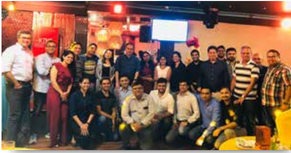
Informal team building celebration at RenewSys Mumbai