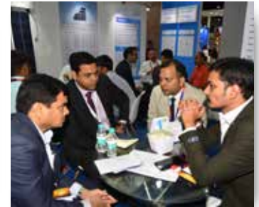
Team RenewSys at the Renewable Energy India Expo 2019, Greater Noida