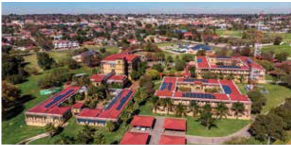
250 KW: Brakpan, South Africa