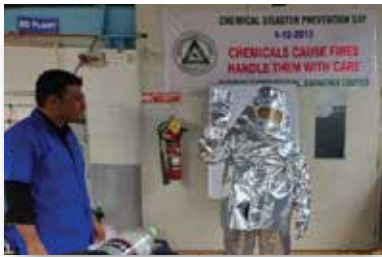
RenewSys promotes safety with the celebration of Chemical Disaster Prevention Day with workshops and trainings on chemical handling!