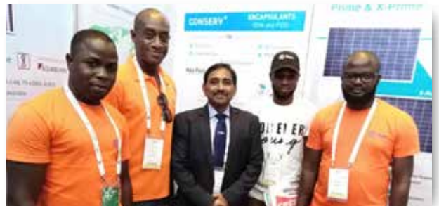
RenewSys wins an Award for the 'Achievement in Efficient Use of Energy and Climate Change' in the Industrial Category, at NAEE 2019