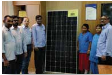
The members of team RenewSys who worked on the making of a landmark PV Module celebrate