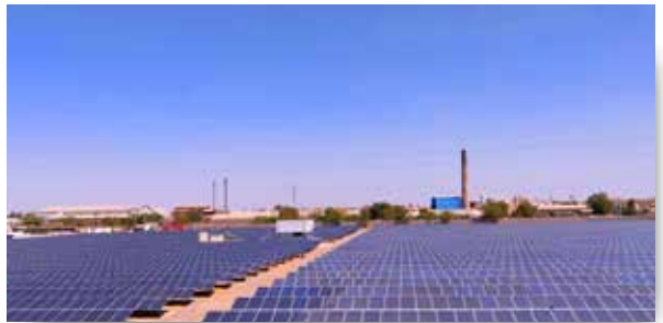
5.15 MW: Pali, Rajasthan, India