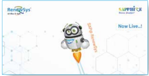
RenewSys achieved a milestone as SAP systems are now live across the organisation