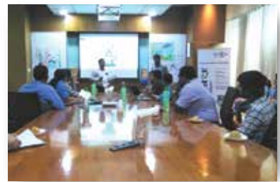
RenewSys renews its commitment to energy conservation with an awareness session & poster competition on the National Energy Conservation Day