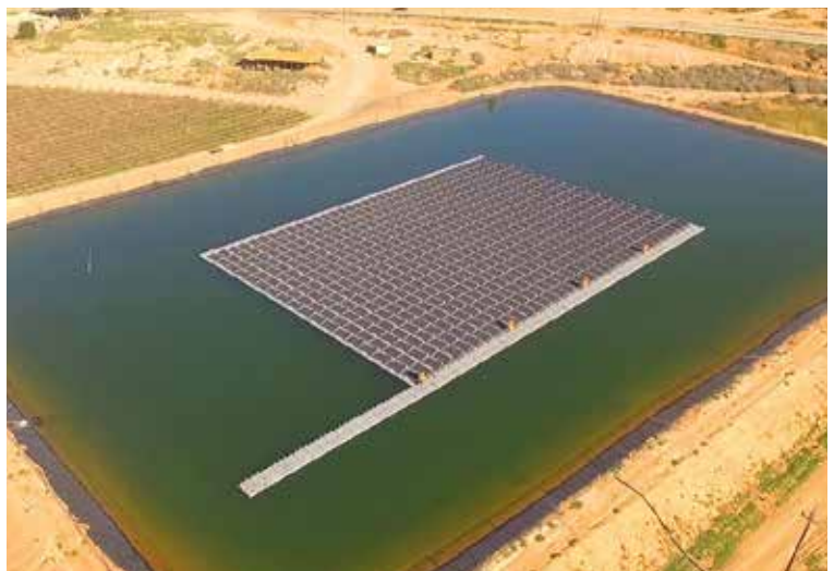
233 KW - Western Cape, South Africa